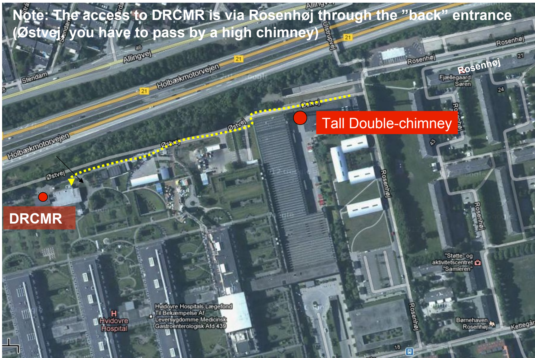
DRCMR, Hvidovre Hospital, Kettegaard Allé 30, DK-2650 Hvidovre, Denmark

Note: The access to DRCMR is via Rosenhøj through the "back" entrance (Østvej you have to pass by a high chimney)